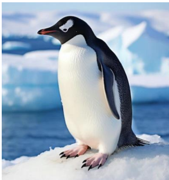
The modern blue penguin, the smallest known living penguin.

By propounding an evolutionary story, the au-