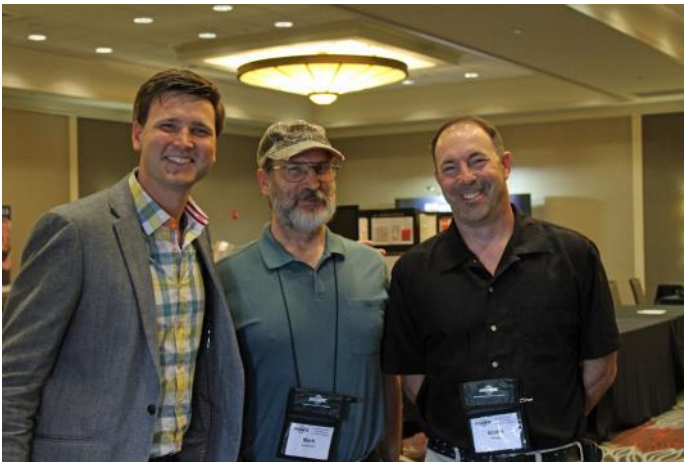
Me with David Rives of Creation in the 21st Century and Bodie Hodge of Answers In Genesis

Topics ranged from Pre-flood geography, to dinosaur kinds, to the Genesis chronology, the latest in Creation astronomy, to the bombardier beetle, even the controversial topic of feath-