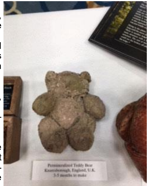
Petrified Teddy Bear

Throughout the day, outside the conference hall, CMI had tables filled with books, clothing, DVDs, CDs, magazines, and miscellaneous items. There were some great deals, especially at the end of the week.