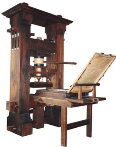
The first printer; by Gutenberg