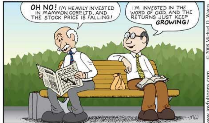
Blessed is the man who finds wisdom, the man who gains understanding, for she is more profitable than silver and yields better returns than gold. — PROVERBS 3:13-14 NIV