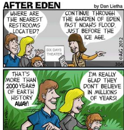
Restrooms at the Creation Museum

The Creation Museum , http://creationmuseum.org/ has daily events.