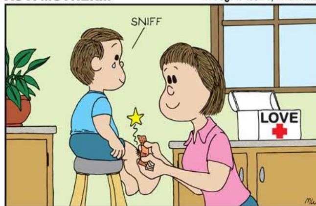
As a mother comforts her child, so will I comfort you; and you will be comforted over Jerusalem. —ISAIAH 66:13 NIV