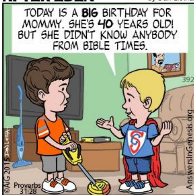
Young Eyes and Old Age