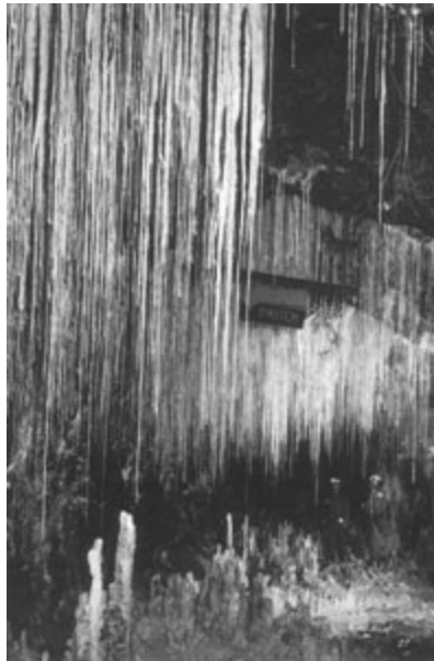
In a 55 year old mine

Over vast ages under these conditions, the peat supposedly metamorphoses into coal.” The problem is, it does not happen that way. Peat that does accumulate in swamps “appears nothing like coal”.