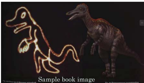
Sample book image