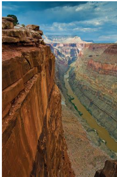
Grand Canyon at Toroweap

Secular geologists have had to resort to imagined rescuing devices like episodic uplift due to tectonic forces in order to explain the existence of today's continents. However, much of Canada and the eastern United States have not experienced any significant geologic uplift since the creation of the Appalachian Mountains over 250 million years ago, according to the secular timescale. Considering that much of these areas is less than 1,000 feet above sea level, it's a wonder there's any dry land at all in these regions.