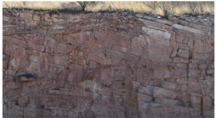
Coconino Cross Beds: From reference 1, Figure 2